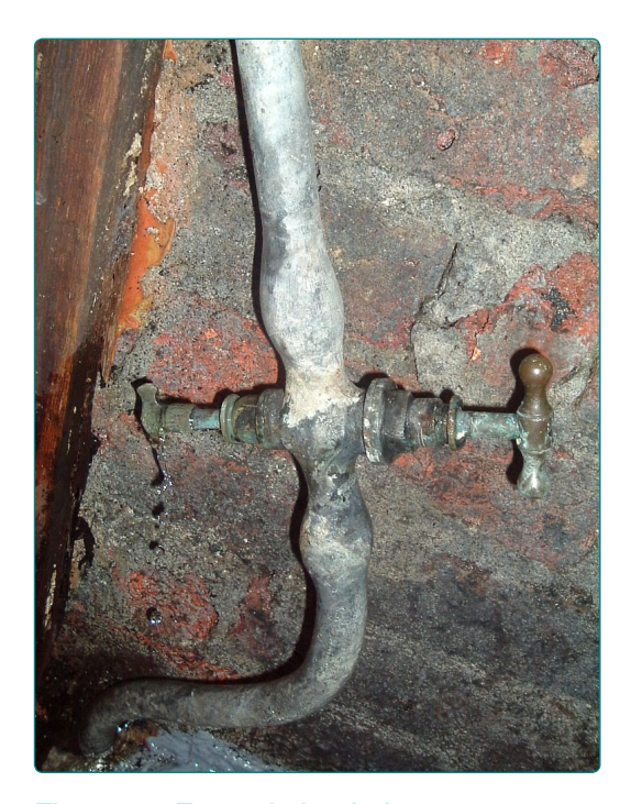
Figure 5 - Example lead pipe arrangement

of its length as possible to see if it is made of lead. Unpainted lead pipes are dull grey in colour. They are also soft. If you scrape the surface gently, you will see the shiny, silver-coloured metal beneath.