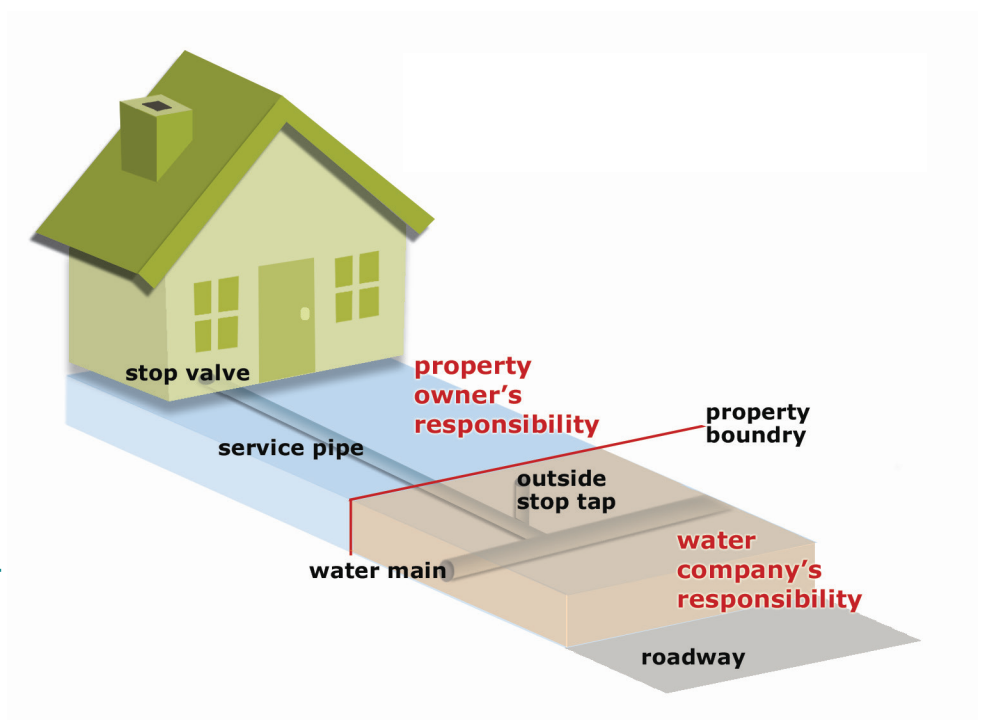
Figure 1 – Typical water supply arrangements