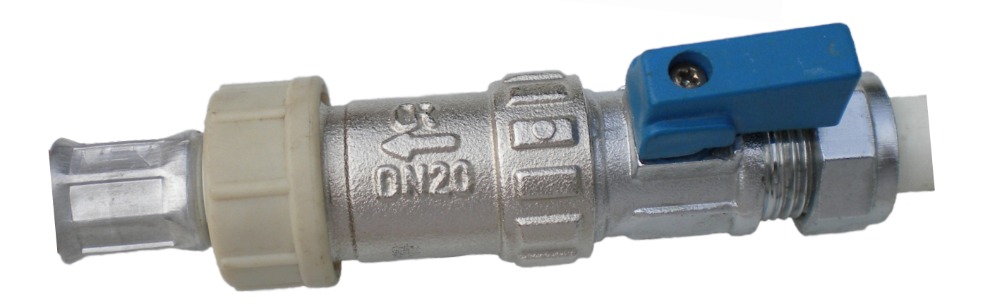
Figure 3 - washing machine cold water valves with check valve