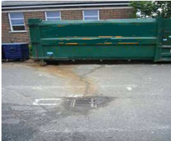
Compactor run-off polluting surface water

Compactor waste runoff may be considered trade effluent and would be controlled by the Sewerage Undertaker by 'Consent to Discharge'. The runoff waste water must be directed to foul sewer, discharges to surface water or storm drains are not acceptable as the waste has the potential to cause environmental pollution and with risk of prosecution.