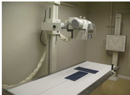
Typical X-ray Machine

Conventional film technology using wet development processes are still in use but are being phased out by digital systems.