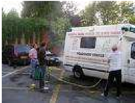
Ambulance being washed and cleaned on a healthcare site

Transportation, such as providing ambulance services, is an essential part of many hospitals activities. Associated with the provision of these services is an ongoing requirement to clean and maintain vehicles. This is often undertaken on the hospital premises and if not properly managed the resultant effluent and run-off from vehicle washing can pollute water courses. Pollutants include dirt, brake dust, traffic film residuals, oils and cleaning agents.