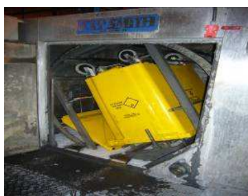
Clinical waste cart bin washing

Some Healthcare organisation and most clinical waste management sites clean clinical waste carts on site for redistribution. Sites either have a bin washer machine or wash them with pressure washers and cleaning agents.