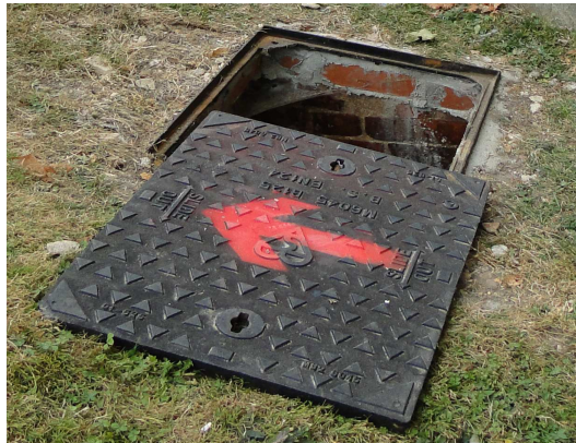
Drain marking – red for foul – on a hospital site.

It is good practice to mark your drainage systems and provide details on up-to-date drainage plans. Red for foul and blue for surface drainage, marking with an arrow in the direction of flow. This information should always be held on site for quick reference as it is extremely useful to the regulatory bodies and Sewerage Undertakers in the event of an on-site incident or spillage and in controlling its escape from site.